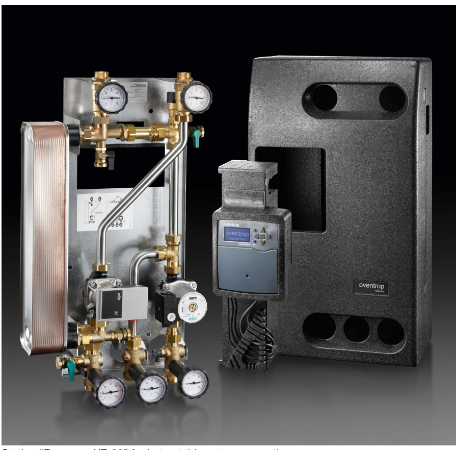
Station "Regumaq XZ-30" for hot potable water preparation